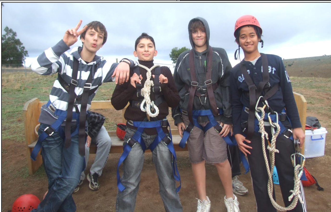
Lake Dewar Camp 2010: Year 7 students had a great time at camp participating in a range of activities [See report page 4]