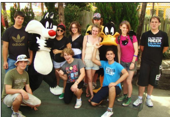
Year 11 Queensland Camp