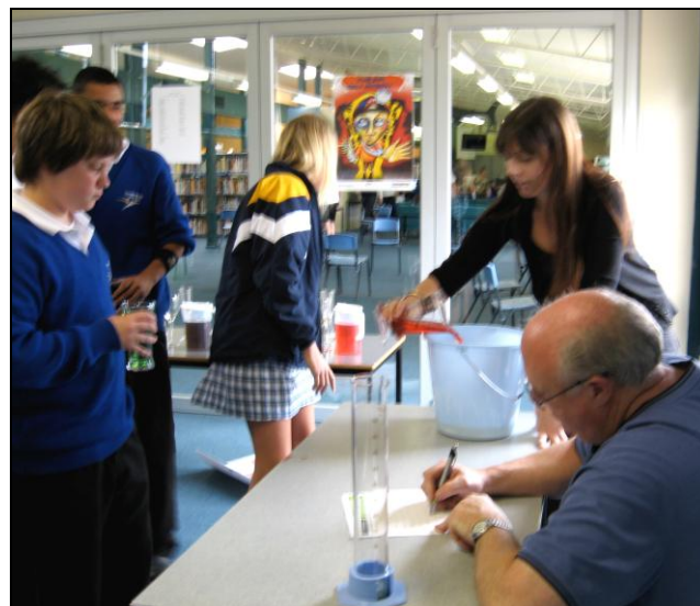
Year 9 Party Safe Day: measuring alcohol levels in drinks