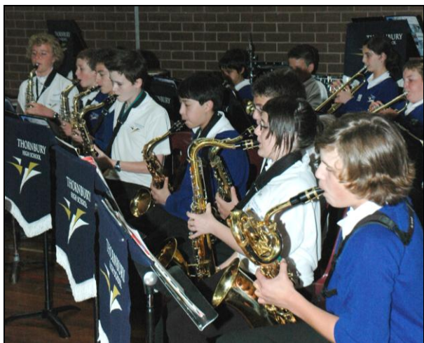
Year 7 Information Night: Music performance